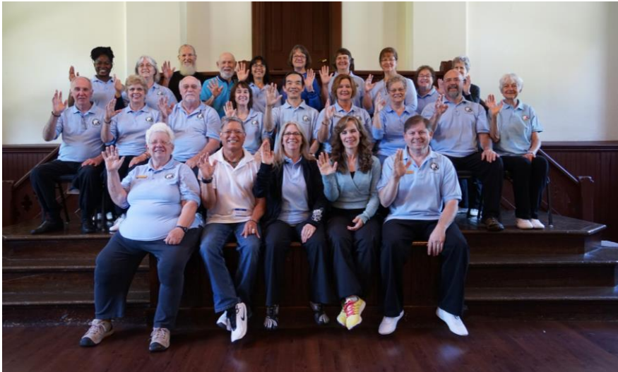
The very first Master Class in Racine, Wisconsin. Six candidates gained their Teaching Certificates for the Yang 24 Forms or Sun 73 Forms