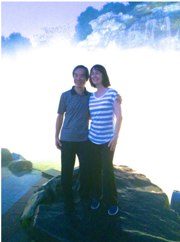
Last night of the China Tour.